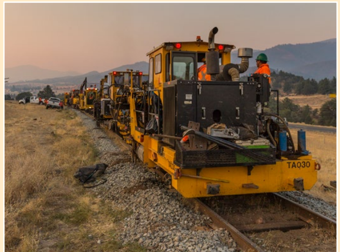
A production gang working to rehabilitate the Central Oregon & Pacific Railroad (CORP) posed briefly for an early morning team photo and then quickly got on their way. While working amid beautiful surroundings and wildlife in southern Oregon and Northern California, they've also confronted some sweltering temperatures and dodged a few rattlesnakes.

See more of our work on CORP on the cover of this issue of RailWorks Today and in a couple of videos posted for employees on SharePoint, including one from on top of a tie crane shot with a GoPro camera.