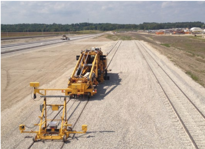
RailWorks employees use a tamper and ballast regulator as they wrap up construction at Iowa Fertilizer.

The RailWorks-constructed wye track connects to a mainline of BNSF Railway, which will serve the facility. When operational later this year, Iowa Fertilizer will produce 1.5 million to 2 million metric tons of fertilizer products and diesel exhaust fluid.