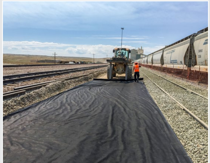
To prevent vegetation growth, crews installed 9,600 feet of geotextile fabric in the area between tracks in Solvay's rail yard. Once in place, the fabric is covered in ballast to keep it in place.

RailWorks Track Systems crews based in Chehalis and Spokane, WA, and Ogden, UT, have been working together to help Solvay Chemicals upgrade the track infrastructure at its mining, refining and manufacturing facility in Green River, WY, to handle increased production.