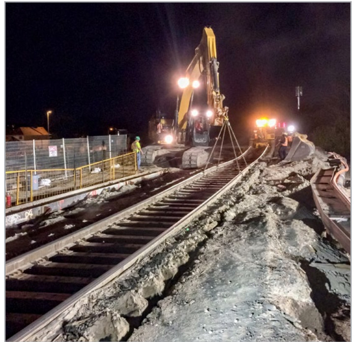
A track crew removed and reinstalled 90-foot track panels during the project.