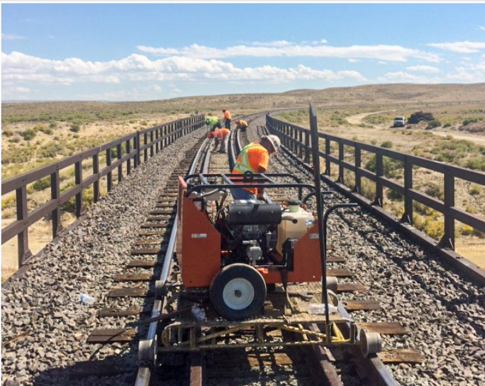
RailWorks installed guardrail on a 320-foot steel-girder, ballast-deck bridge on a spur that connects Solvay Chemicals in Green River, WY, with Union Pacific, the servicing railroad. The crew also changed out the cross ties on the bridge.